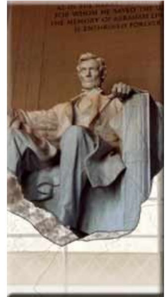
As with the Romans and Greeks of old, the TV has become the modern day theater and amphitheater

What would have happened a century ago if a gay and lesbian demonstration appeared in the streets of one of our major cities? I am sure some folks with shotguns would have run them off! (Intolerance, some may say, or just reactionary shock?!) Now these "alternative lifestyles" are generally accepted and permeate all of society, especially the media. Any negative comments are called "homophobic" and are "gay bashing." The gay movement is now being equated with the Civil Rights movement of the 1960s. Hardly comparable! Gay marriages? Gay pastors and priests? How far will this go?